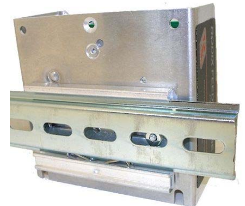
Bracket securely installed on DIN rail

DIN RAIL MOUNTING KIT P/N 123-000-0372 IMPORTANT: APPLICATION NOTE